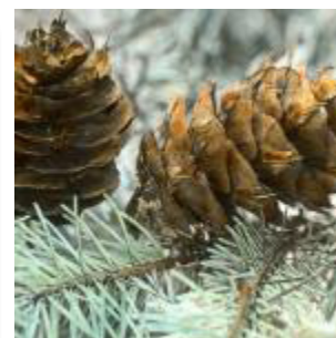
See page 2...