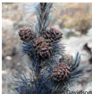
Pinus Albicaulis Cones