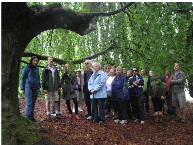
by Christine Hatfull

Future uses at Riverview should build upon these significant values. Thus, our vision includes the following objectives and recommendations for action: