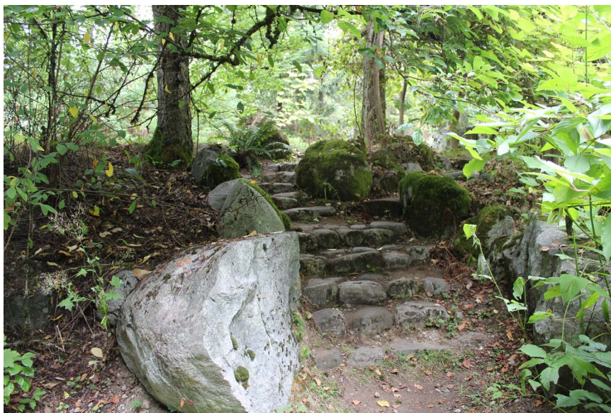
by Brian Wormald

We want to ensure a land use planning process that will build on the existing values of Riverview and respect its heritage.