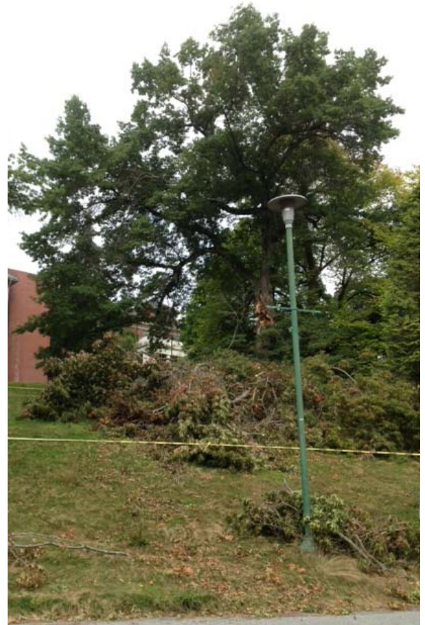
NEGLECTED GROUNDS Summer 2013 What a Mess

"Our common goal is to act as responsible stewards of the lands within the context of a working institutional facility. We are also invested in working together to ensure that the lands' key features - the tree collection, natural areas and cultural landscape - are properly managed as the next use of the site is determined by BC Housing."