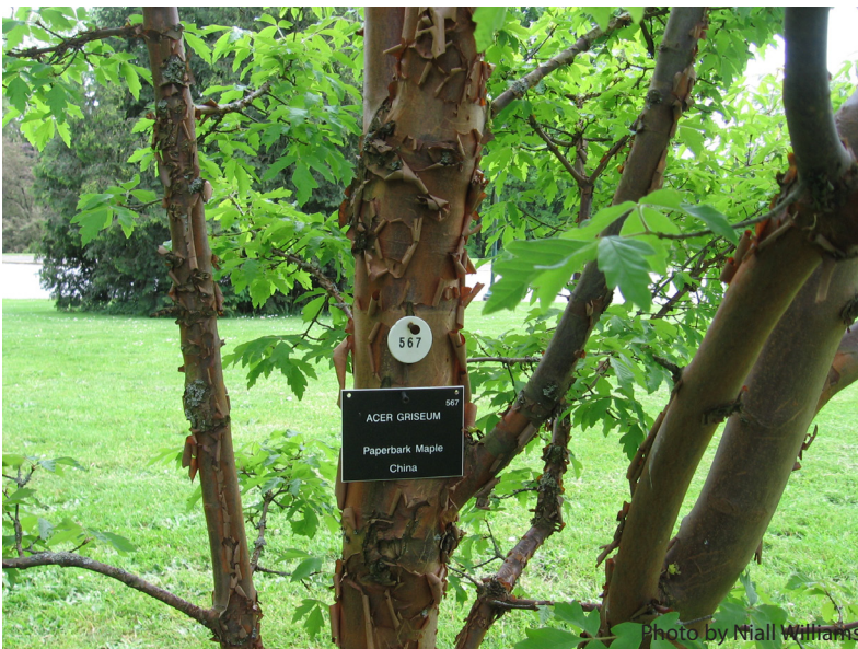
#567 Acer griseum , Paper Bark Maple

Acer griseum , Paper-bark Maple, #567, is found on the lawn in front of Centre Lawn or #1969 east of Crease, near the Boiler house. It was found in central China in 1901, and can grow to 14m. The samaras are fairly large, and angle at about 90 degrees, the fruit is often sterile, hence the scarcity of this species. The bark has papery scrolls in a rich cinnamon colour, which peel off in the same way as the similarly named Birch.