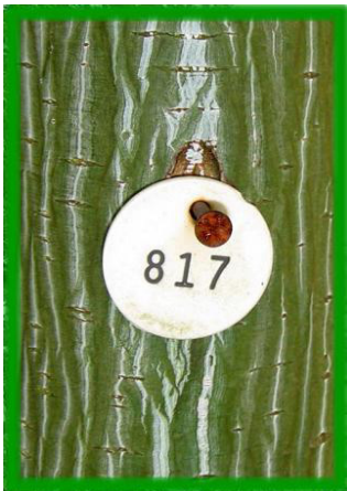
#817 Acer davidii , Pere David's Maple

Acer davidii , Pere David's Maple, #817, beside Roadside Building is also a snake-bark maple, with a brown-grey trunk, with snake-like stripes on it. This specimen has multiple trunks, which is often a feature of this variety. It has similar samaras to A. capillipes , hanging in elegant tiers, and can reach a height of 17m.. It was discovered in China, by Pere David, a Trappist monk, who was a distinguished botanist and plant finder. He also found Davidia involucreta , Dove or Handkerchief Tree, # 752,754, in China in 1869.