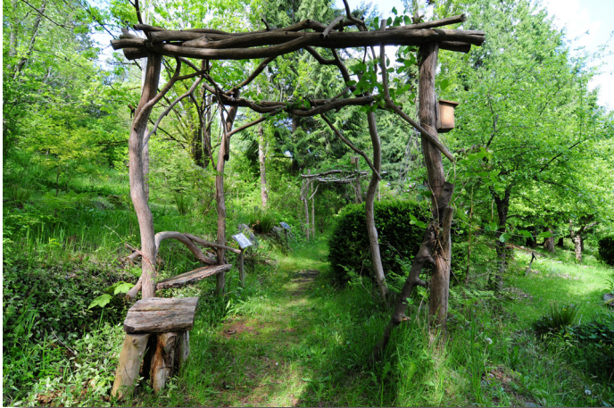
by George Reamsbottom

Volunteers from RHCS have been finding damage to Finnie's Garden where they have worked years protecting and restoring the native flora and fauna. It appears someone has been ripping out the native plants and shrubs and replanting non native plants without the permission of RHCS who continue to be the stewards of this garden and lands, thus damaging the environment in the process. It is unfortunate when members of the public damage our natural areas.