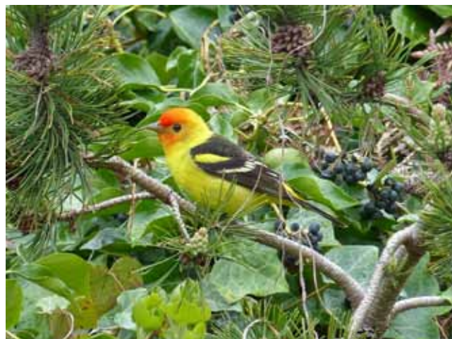
Western Tanager at Riverview